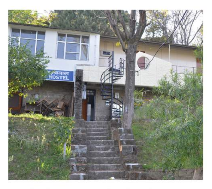
SHIVALIK BOYS HOSTEL