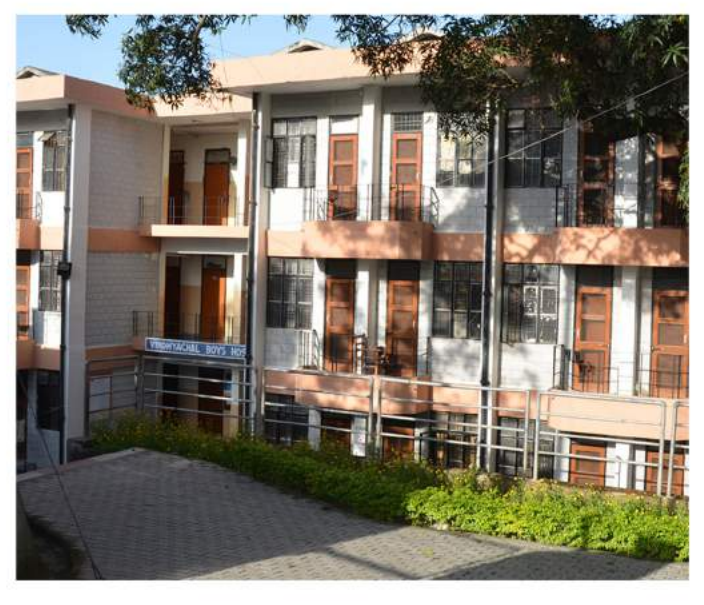
VINDHYACHAL BOYS HOSTEL