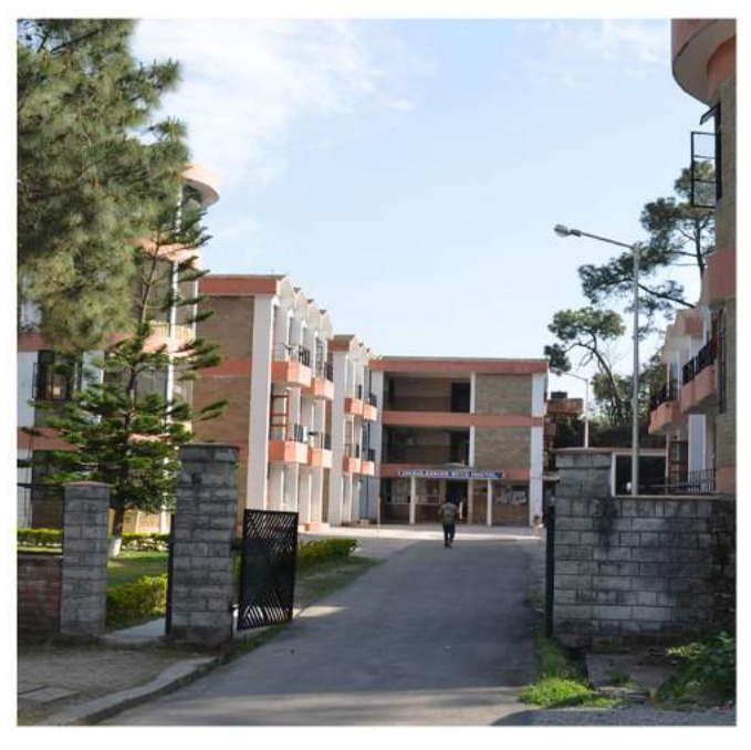
DHAULADHAR BOYS HOSTEL