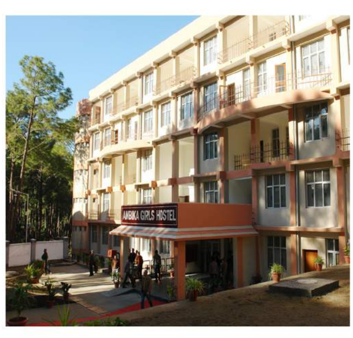
AMBIKA GIRLS HOSTEL