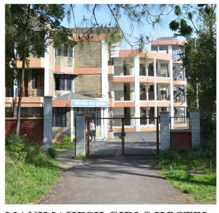
MANIMAHESH GIRLS HOSTEL