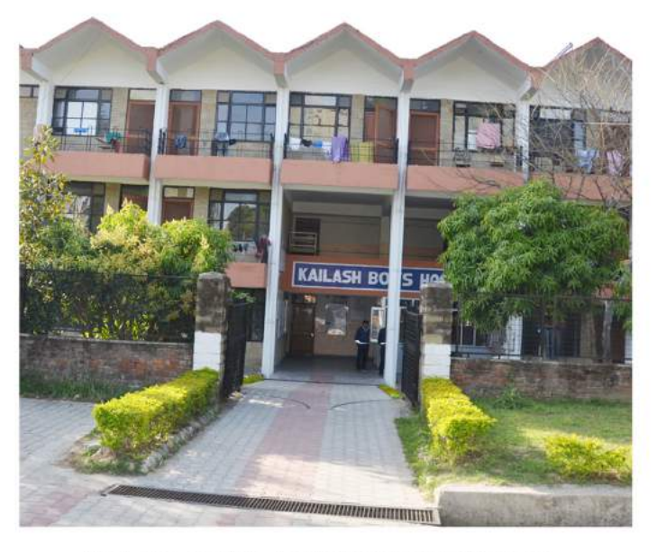
KAILASH BOYS HOSTEL