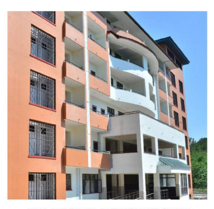
UDAYGIRI BOYS HOSTEL