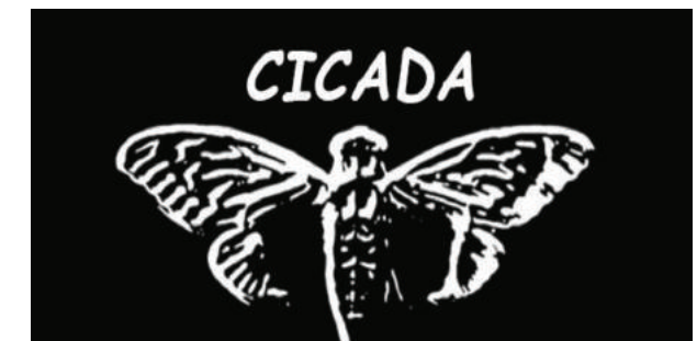
GIZEM : Perceiving the Q-verse

Epilysi will provide a platform where a logical approach will make the difference and, participants would get to apply their knowledge to solve actual problems. As a result, we kindly encourage all coding enthusiasts to be a part of this historic event. Winners will be benefited with cash prizes & goodies, and fame will be a follower.