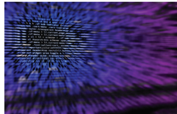
VIVIDHATA : A blend of Ideas

"Hackathons are said to be the fastest way to innovation."