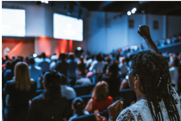
IMPRENDITORIA : Innovation on point

One good idea is all you need to start a fortune. Innovations and ideas shape our future. Idea Incubation Programme involves ideation and collaboration on possible solutions in a competitive atmosphere, involving a wide range of students.