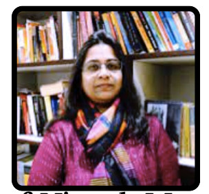
School of HSS IIT Indore