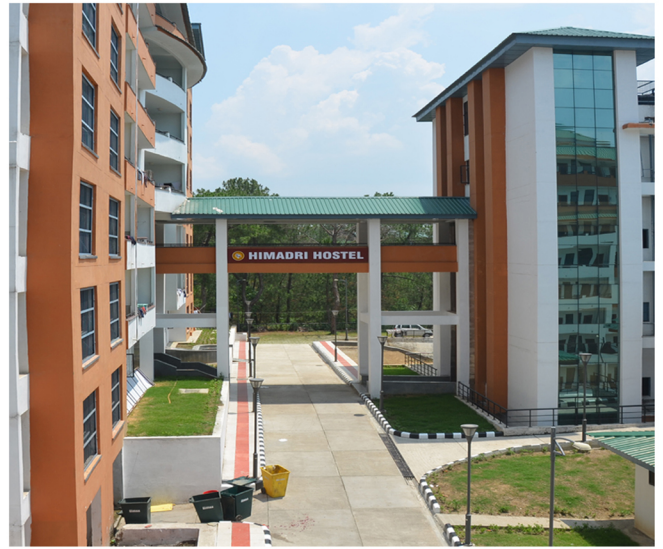
HIMADRI BOYS HOSTEL