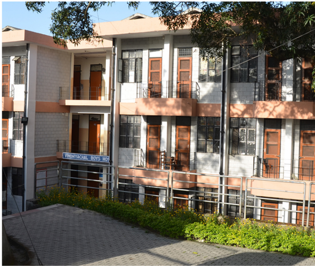
VINDHYACHAL BOYS HOSTEL