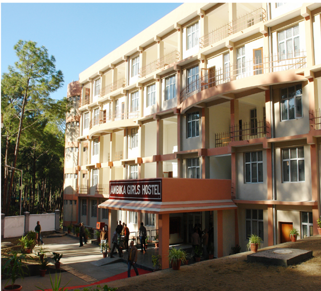
AMBIKA GIRLS HOSTEL