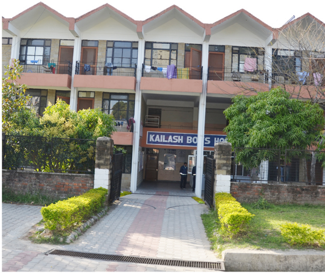
KAILASH BOYS HOSTEL