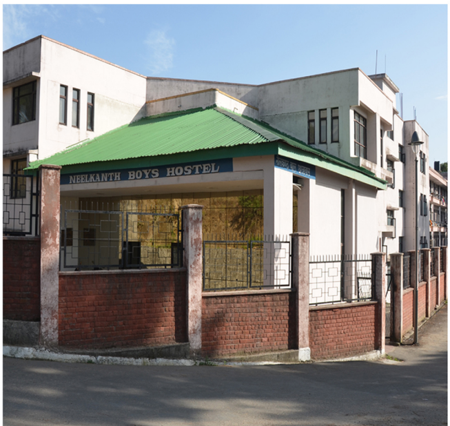
NEELKANTH BOYS HOSTEL