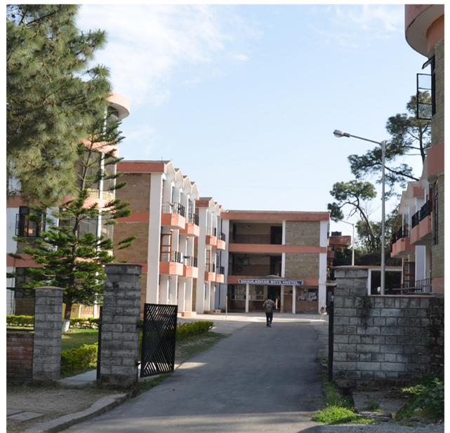
DHAULADHAR BOYS HOSTEL