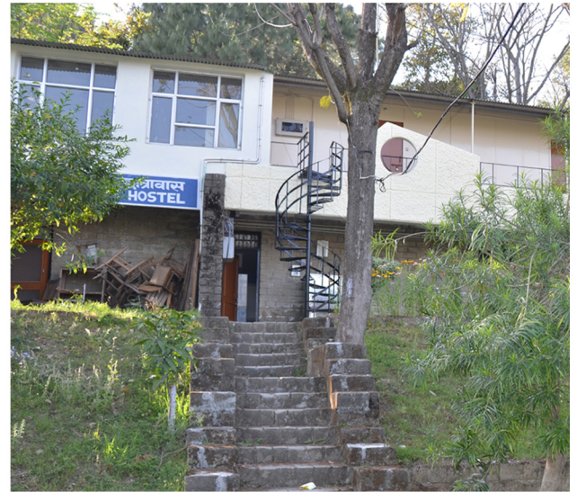
SHIVALIK BOYS HOSTEL