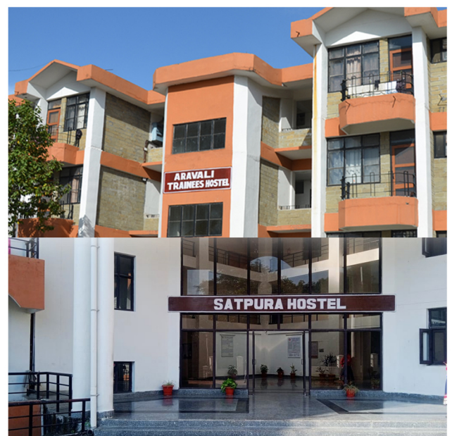
ARAVALI & SATPURA GIRLS HOSTEL