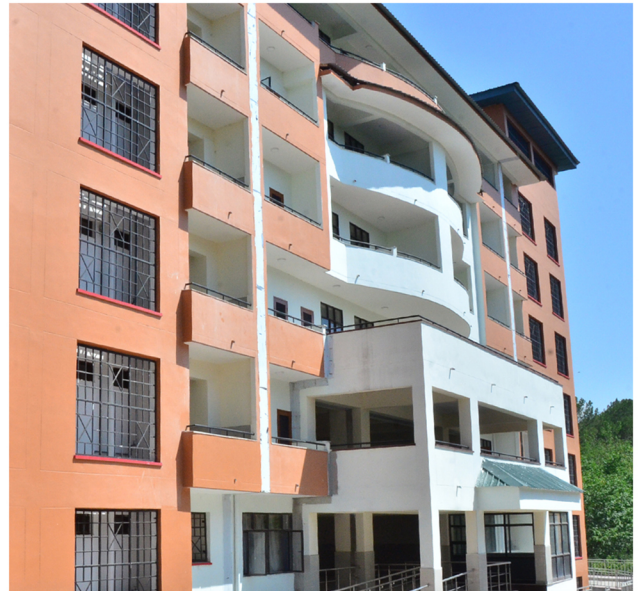
UDAYGIRI BOYS HOSTEL