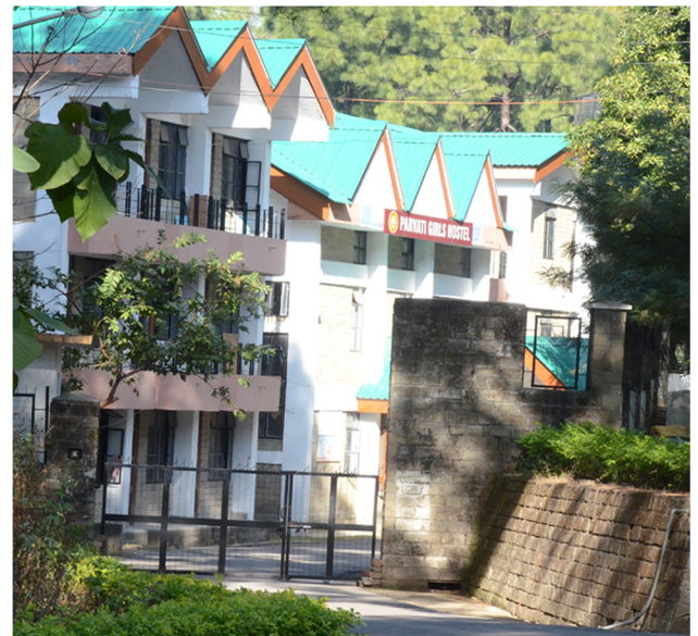
PARVATI GIRLS HOSTEL