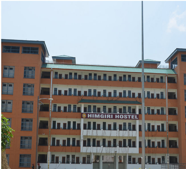
HIMGIRI BOYS HOSTEL