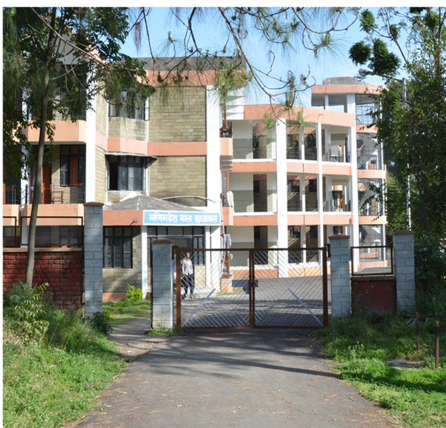
MANIMAHESH GIRLS HOSTEL