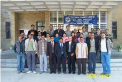
Participants of Short Term Course on "Modern Library Management"