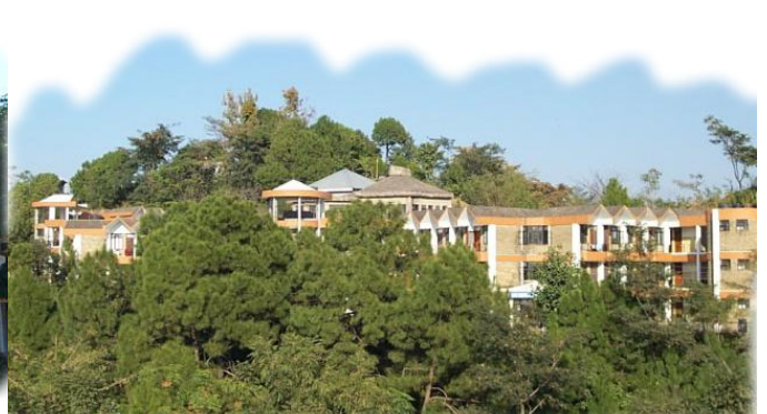
A panoramic view of NIT Hamirpur