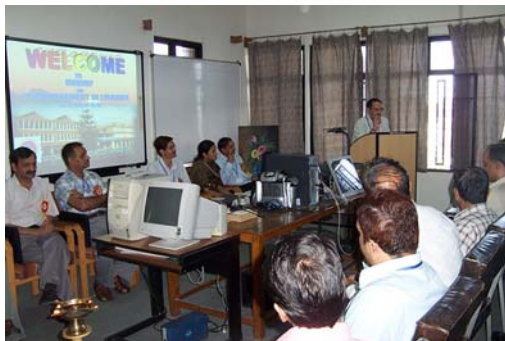
Workshop on "IT Management in Library"