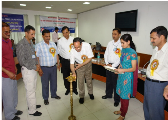
Lamp lighting ceremony of RACMP-09