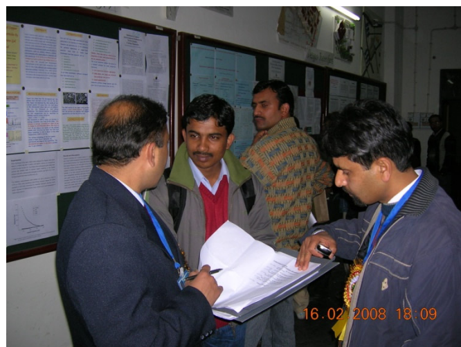
Poster Session during RAIM-08