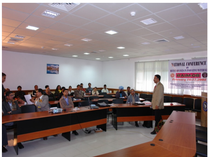
Invited lecture during RAIM-08