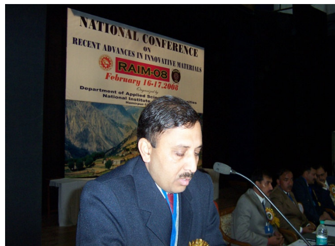
Inaugural Ceremony of National Conference on Recent Advances in Innovative Materials RAIM-08