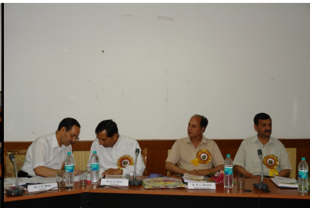
Dignitaries on the dais at the inaugural of RACMP-09